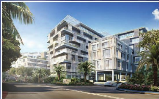
THE NEW RITZ-CARLTON RESIDENCES, MIAMI BEACH OCCUPY SEVEN ACRES ON GORGEOUS SURPRISE LAKE. RIGHT: PIERO LISSONI