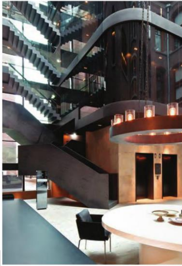
AMIT GERON DBOX