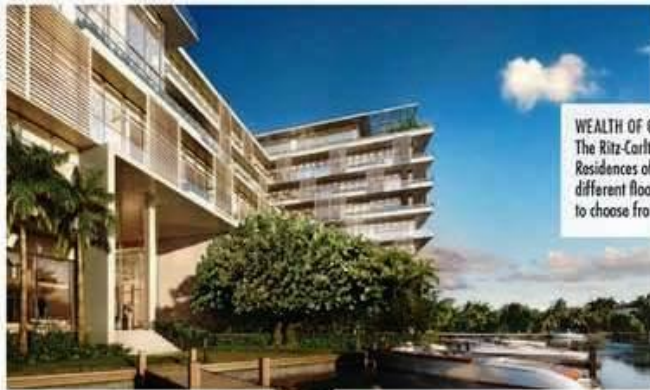
WEALTH OF OPTIONS The Ritz-Carlton Residences offer 60 different floor plans to choose from.