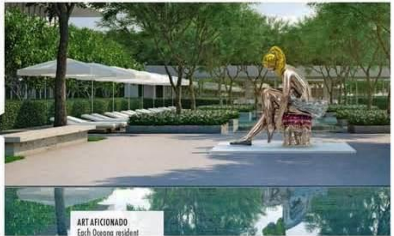
ART AFICIONADO Each Oceana resident will be a part owner of a Jeff Koons sculpture.